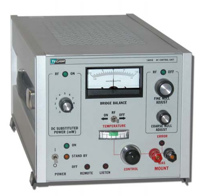
Figure 2 – TEGAM Model 1805B RF Level Controller.

Several years ago, Weinschel Corp. employed a method in their power sensor calibration system to make the task more manageable. Instead of measuring changes in the DC voltage, an analog leveling loop was used to set the DC power. This made the task of calibrating RF power sensors simpler and faster because the operator did not need to take and record readings from a voltmeter and then calculate DC substituted power. With an analog leveling loop the operator simply selected the desired test level.